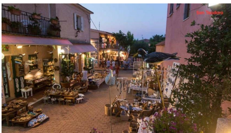
Sept 05 to 09 - On Board (B,L,D)

We continue to explore Spiaggia del Principe, Mortorio, Cala Coticcio, Piscine di Budelli, and Porto Cervo.