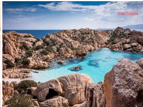
Sept 09 to 11 - Alghero (B)

Early morning check out from our Catamaran and transfer to Alghero were we will spend our last 02 nights in superior accommodation.